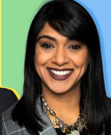
Hon. Bardish Chagger MP for Waterloo 519-746-1573 bardish.chagger@parl.gc.ca